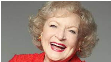
Betty White (1922-2021)

Social Media, Join SPO, Request for Student & Alumni Highlights