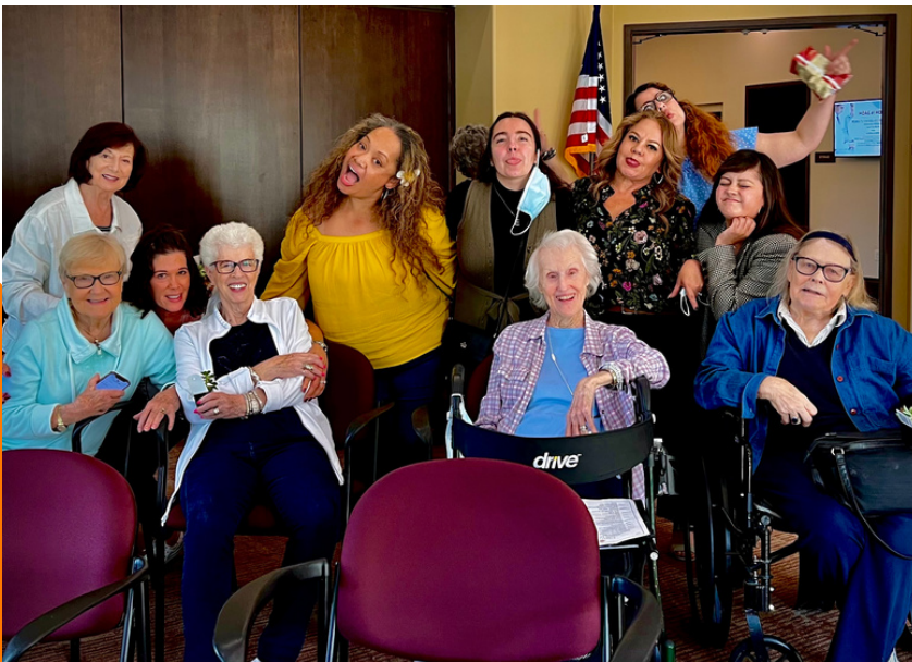
SPO members and Crestvilla residents enjoying each other's time.