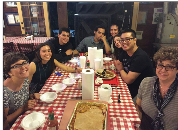
about the university's lack of transparency and the College Media Convention in Austin.

At the College Media Convention in Austin, Texas in October, Editor