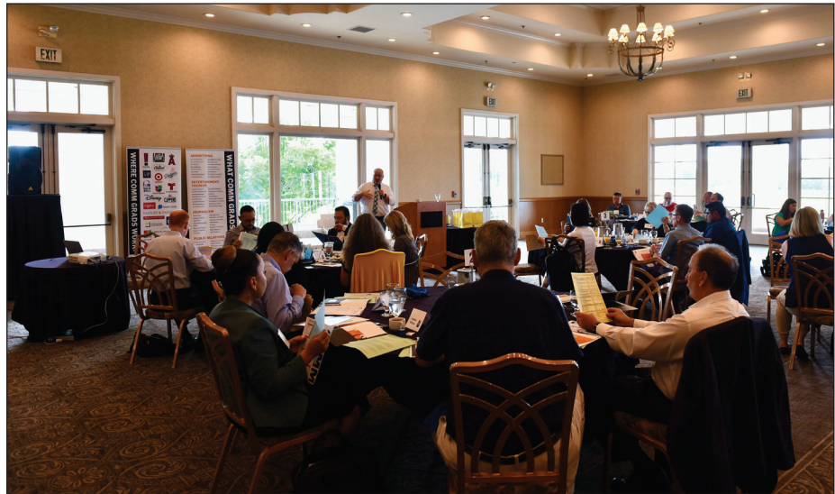
As a result of the campus work from home order, faculty in the Department of Communications planned for the academic year via Zoom, rather than an off-site retreat in years past (above).

faculty rank (tenured faculty, tenure-track faculty, full-time lecturers, and part-time lecturers).