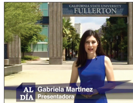
Student journalists won a Murrow Award (top) and several awards from the College Media Association and the Associated Collegiate Press (bottom left). Al Día 's newscasts won several awards (bottom right).