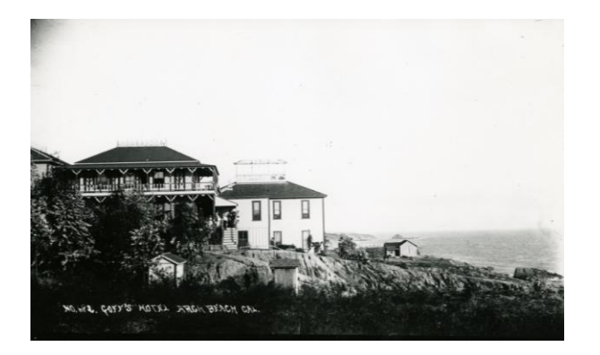
Figure 5: (above) Goff's Arch Beach Hotel in the 1880s (below) Swimmers in Laguna and campers at Newport in 1891