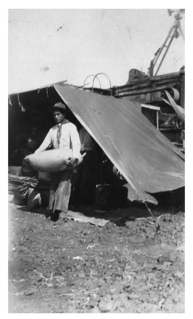
Figure 2: Unidentified Indian Laborer working in a bean field in Santa Ana or Irvine area