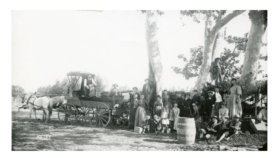
Figure 4: Apricot drying work party in Tustin, Calif.