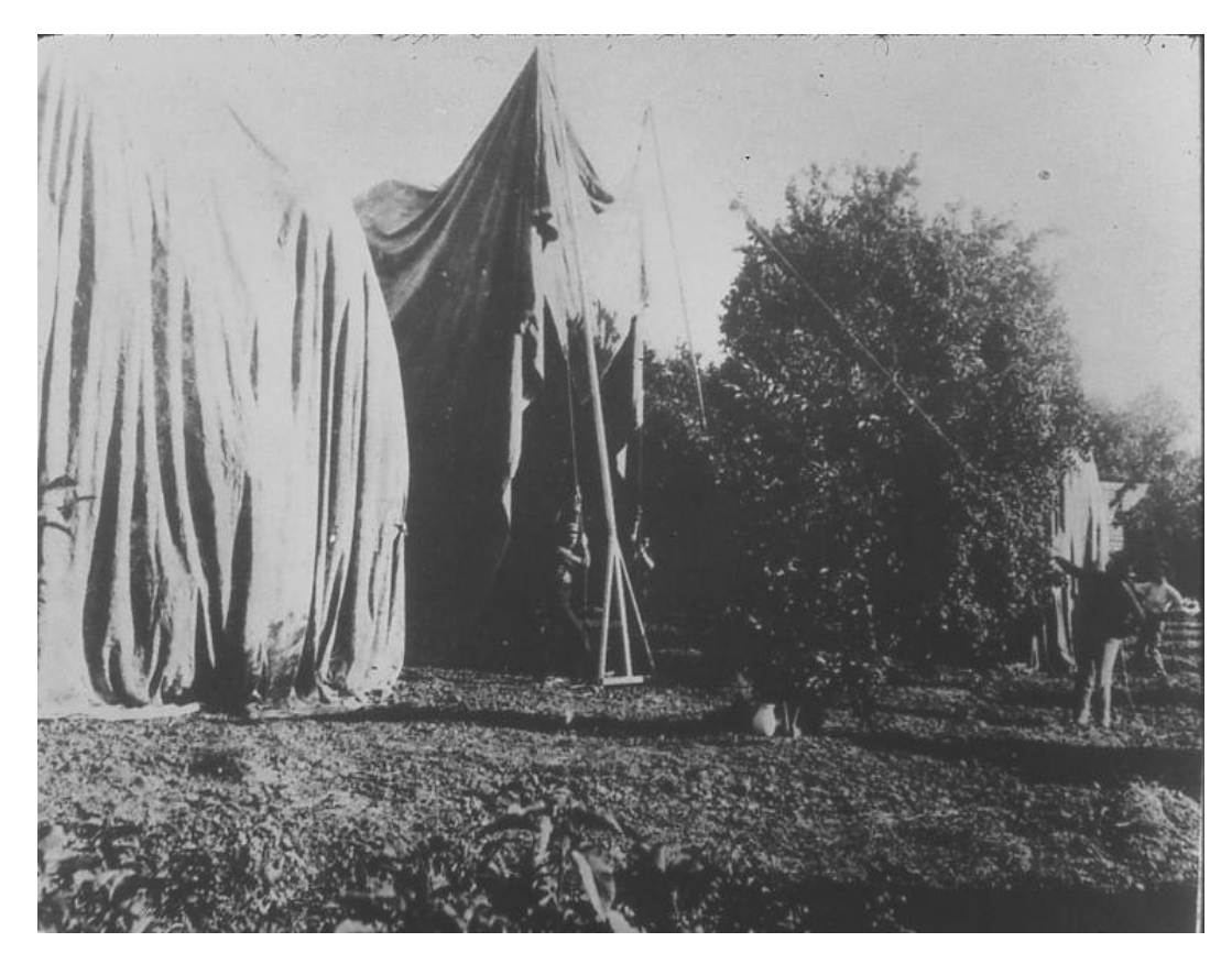
Figure 1: Tenting trees for fumigation