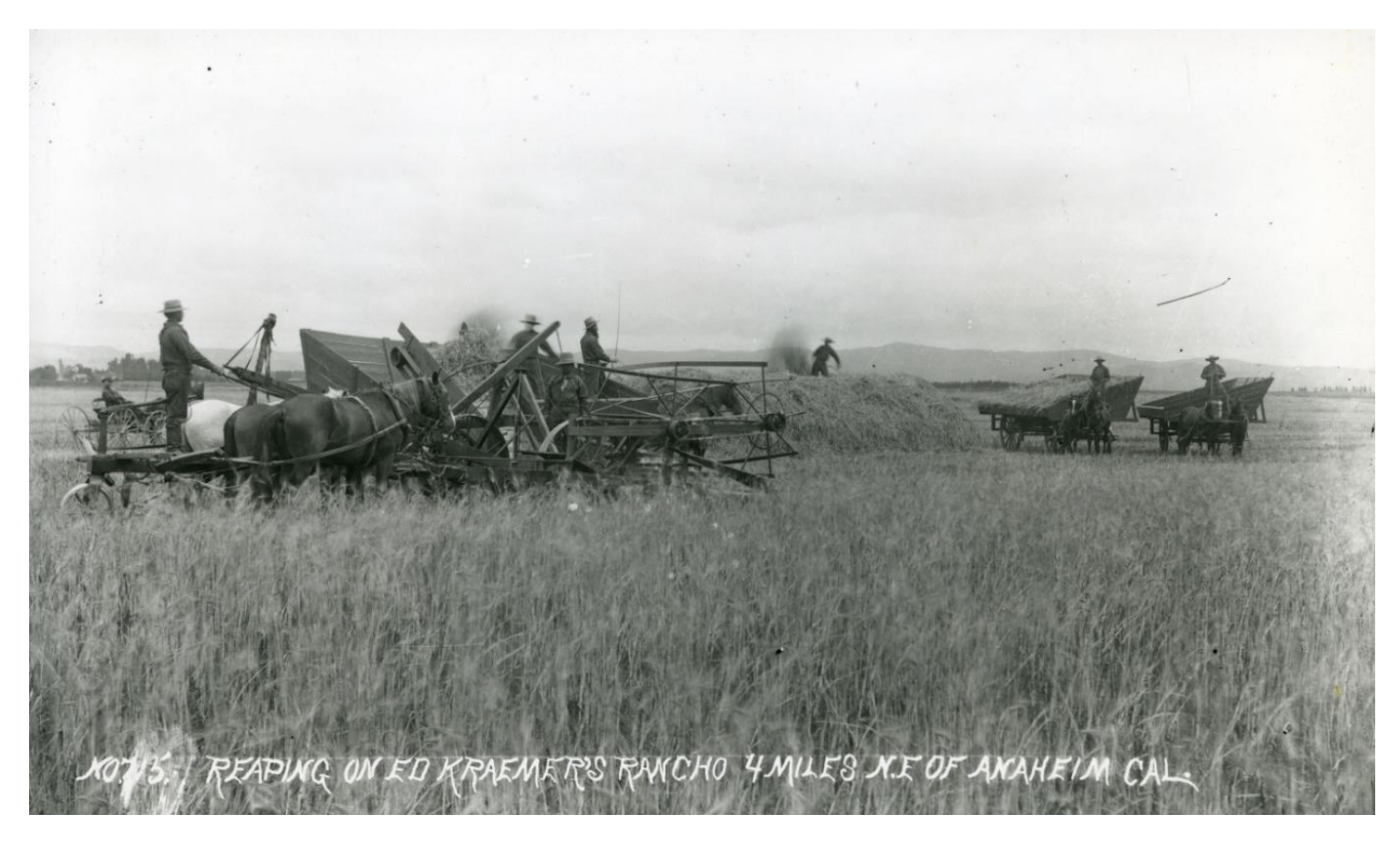
Figure 8: Reaping on Ed Kraemer's rancho, four miles northeast of Anaheim, Calif.