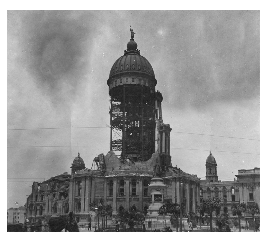
Figure 7: Ruins of San Francisco City Hall