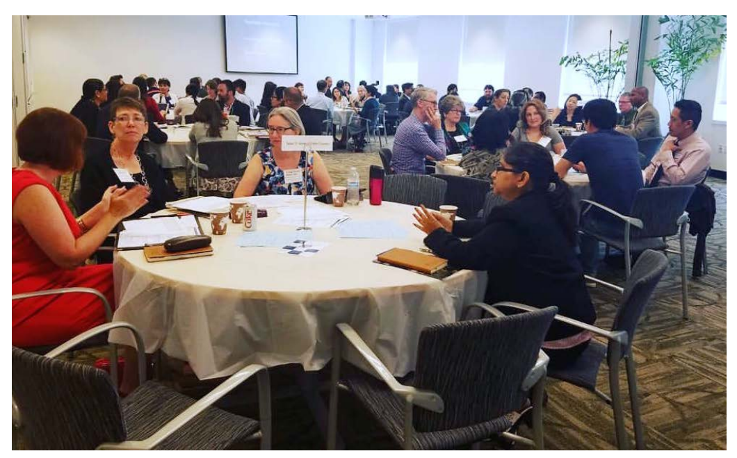
Assessment Forum, 2017