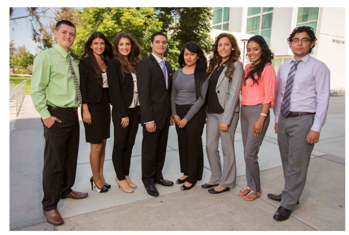
McNair Scholars, 2013