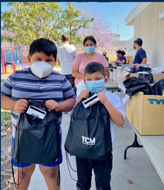
Two boys receive summer camp materials to participate in the summer