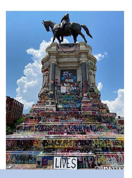
Monument to Confederate General Robert E. Lee, shown here in 1890, when it was first erected, and in 2020, during the protests following George Floyd's murder.

he series of events followed one another as scabs torn from an unhealed national wound: the 2015 Charleston shooting, in which a neo-Confederate left nine African American parishioners dead; the 2017 "Unite the Right" rally of white supremacists in Charlottesville, in which one counterprotester died and dozens more were injured; and the 2020 murder of George Floyd in Minneapolis, captured on smart phone for the horrified eyes of the world to see. Floyd's murder became a national boiling point over police brutality against African Americans that had been building since the 2012 death of Trayvon Martin. Opposing the rise of white Christian nationalism that had supported Donald J. Trump's political rise, the Black Lives Matter movement brought the issue of Confederate memory into contemporary focus.