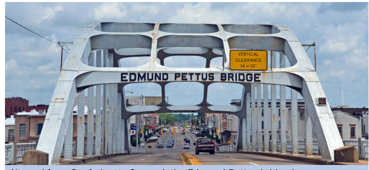
Named for a Confederate General, the Edmund Pettus bridge is now more recognizable for its connection to civil rights activist, John Lewis.

To view the Mapping Confederate Monuments project, please visit: https://demo4hist402a2020fall.omeka.net/