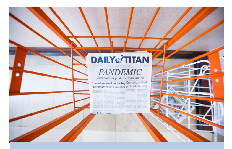
The Daily Titan announced that classes were going online on March 16, 2020. By March 17, staff were told to work from home, as well.

arch 2020. The week after I helped my colleagues set up and work our annual O.C. Politics event, we were told to gather our belongings and to take what we needed to work from home. I thought to myself, "I need our entire server and the archive." I receive frequent requests for materials and they range from various topics. With around 300 projects in our collection, some days I don't know what oral histories I have to investigate. I felt helpless. As I thought of a game plan, I tried to push my stresses away and I copied our most requested projects to my 1TB external hard drive.