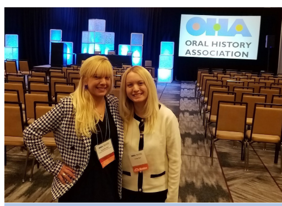
SOHA at OHA 2019 in Salt Lake City, Utah

Today, I am an active committee member of OHA and Past President of SOHA. COPH supported my role as a conference chair for the SOHA conference at CSUF in 2018. The SOHA at OHA 2021 virtual meeting commemorated the 40th anniversary of the organization. We will have our next in-person SOHA conference at UNLV April 1-3, 2022, and the next OHA conference will be held in Los Angeles from October 19-22, 2022. We hope you will consider being a presenter and submit your ideas to our forthcoming call for submissions.