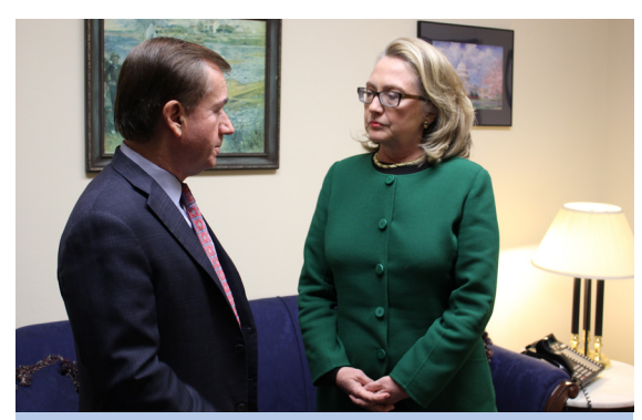
Hilary Rodham Clinton on the day of her first testimony on Benghazi, appearing before the Senate Foreign Relations and the House Foreign Affairs Committees.

Throughout hundreds of correspondence and legislative documents, Royce's unyielding dedication to patriotism, human rights, preservation, safety and security remains evident.