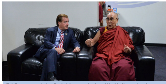
Ed Royce and the Dalai Lama during His Holiness's vist to Orange County in 2015.

The second and final phase for the collection will include uploading folder and document descriptions onto the widely-used online platform, ArchivesSpace, making it more readily available to the public. Expected completion for the Edward R. Royce Collection is anticipated by mid to late 2022.