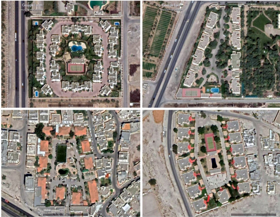
Figure 5. Examples of compound layout; all images are at the same scale. Note the standardized homes.

A compound that began in a peripheral location may eventually cater to a resident of lower socioeconomic status as it ages, as newer compounds are built in more peripheral locations, or as infill brings urbanisation to its gates. This finding has implications for theorising changes in gated communities over time: compounds are not all elite enclaves – variations exist, and compounds may evolve over time in a sort of “gated community life cycle”. Compounds in the Gulf in general, and in Bahrain in particular, differ from gated communities in other global contexts in 4 unique ways: