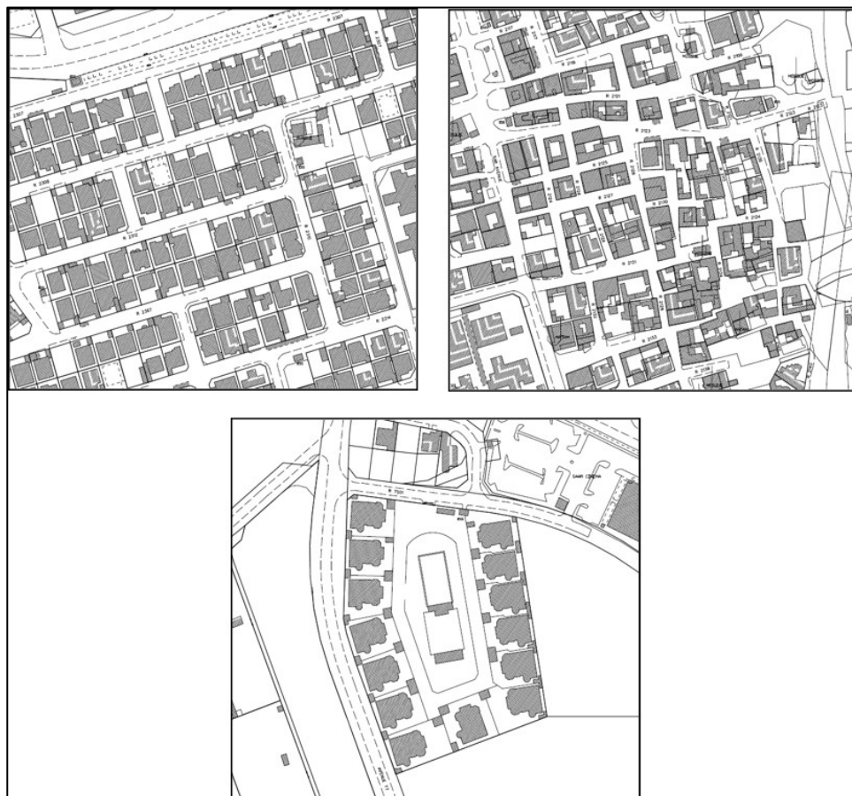
Figure 4. Planned residential area (top left), Village (top right), Compound (lower).

Early planning and zoning guidelines for compound development mandated that a certain percentage (typically about 50%) of the parcel be set aside as open space. Thus, regardless of the number of houses, the first compounds (called “garden villas” in planning documents) were characterised by low density and plentiful open space.