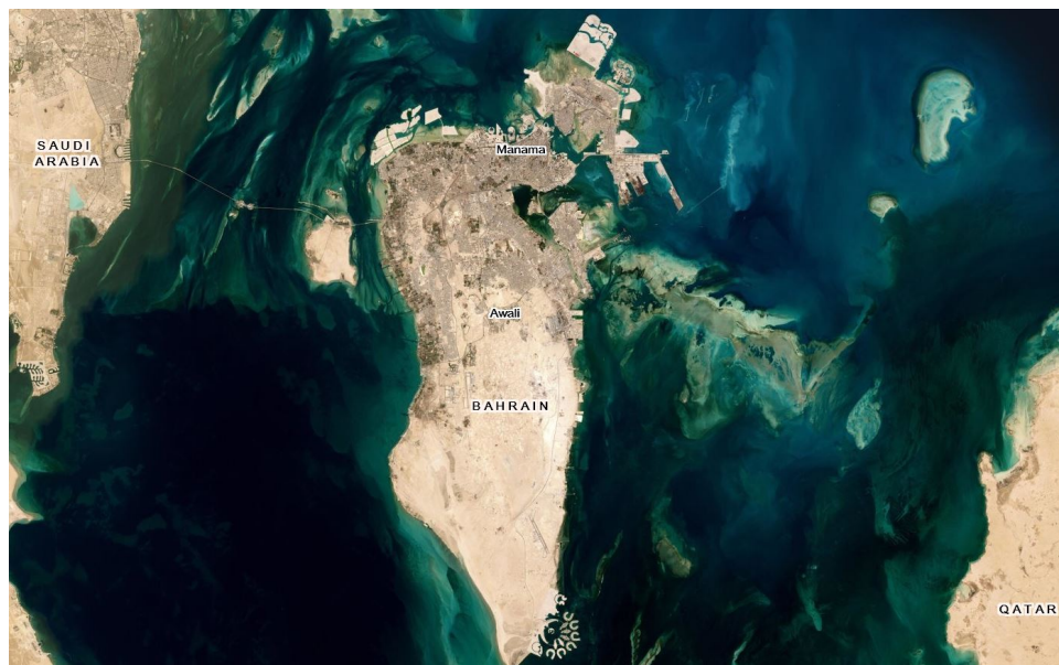
Figure 1. Map of Bahrain, showing locations of Manama and Awali.

Both figures 1 and 2, from a 1956 British map of Bahrain, are at the same scale. Comparing them reveals Awali's large size, lower density, widely spaced housing, modern layout, and exterior wall relative to Manama.