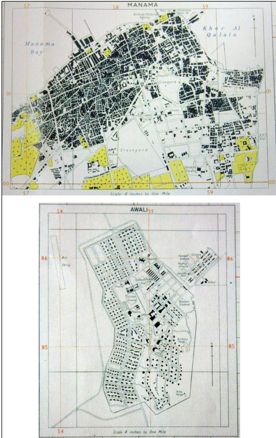
Figure 2. Map of Manama, c. 1956 (upper); Map of Awali, c. 1956 (lower). (Jarman, 2007).