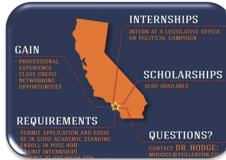
Orange County Fellows